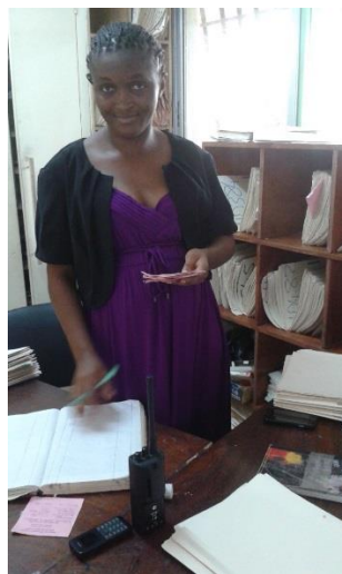
Receptionist, PPASL Wesley Street Static Clinic

Planned Parenthood Sierra Leone (PPASL) works to champion the advancement of SRHR and to enhance the provision of quality services for all, especially the underserved. Funded in part by UNFPA, PPASL provides contraceptive and safe motherhood services; adolescent and youth-friendly SRHR services; STI prevention and management; and HIV counselling and testing, among other programmes.