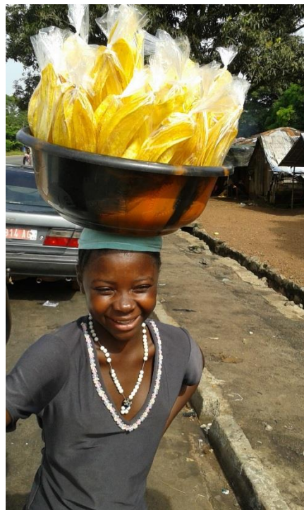
Women and girls selling food in the street between Freetown and Makeni

A car puncture along the road allowed group 1 UK delegates time to speak to the street-sellers along the road from Freetown to Makeni. The girls went to school, but due to the