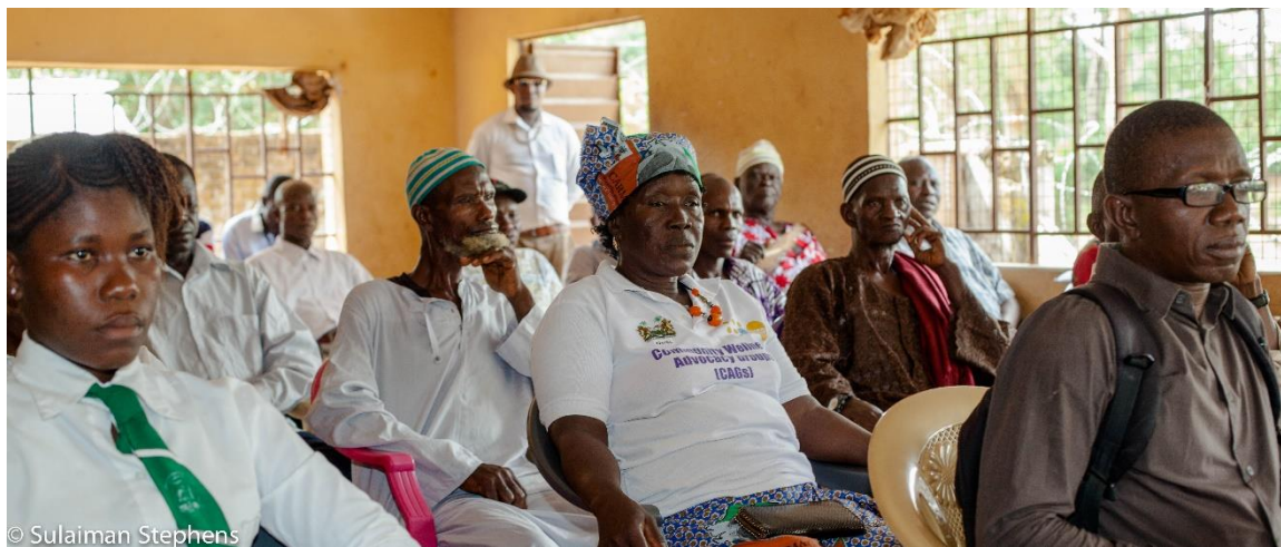
Community representatives at husband school, Binkolo (Bombali District)

The priest noted his happiness with the effect of the husband project. He said: 'God made us equal', and it is important to have a good family life - "the world is one family!" The chief of town said he was happy to see so many children in schools now and child marriage addressed. He was concerned with regards to the poor road infrastructure and women accessing obstetric services timely. He made the request for continued support including motorbikes as vehicles to transport young pregnant girls from the villages into town during obstetric emergencies.