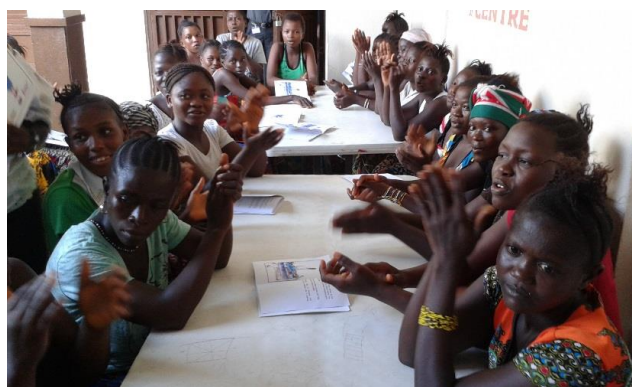
Women and girls awaiting fistula repair receiving life-skills classes, Aberdeen Women's Centre, Freetown