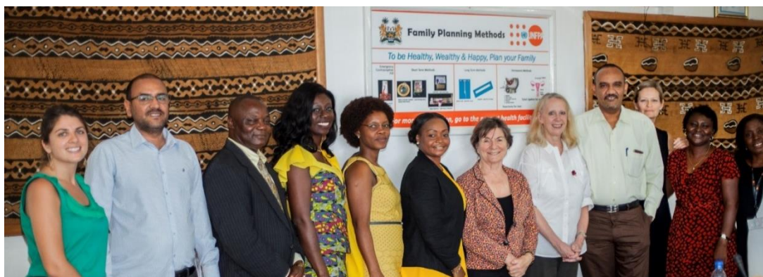
UK delegation with UNFPA representative and staff, UNFPA office, Freetown

The study tour was hosted by UNFPA, Sierra Leone.