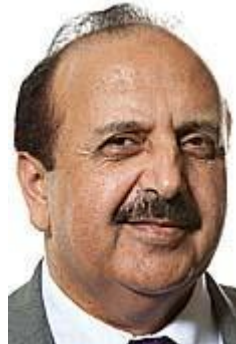
Lord Hussain (LD)

Prior to the study tour Baroness Sheehan said: “I am looking forward to the opportunity to see first-hand the challenges facing health professionals in Sierra Leone in tackling the enormous issues around delivering sexual and reproductive healthcare to women and children. I am particularly interested in the partnership work that DFID undertake.”