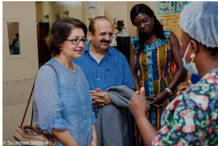
Baroness Sheehan and Lord Hussain visiting Aberdeen Women's Hospital