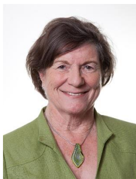
Baroness Jenny Tonge (Independent)

The final delegation included UK APPG on PDRH Chair Baroness Jenny Tonge (Independent), Liz McInnes MP (Labour), Baroness Sheehan (Liberal Democrat) and Lord Hussain (Liberal Democrat). Karl Tuner MP was meant to participate, but sent his apologies one week prior to departure. John Mann MP also sent his apologies the day prior to departure due to illness. Baroness Jenny Tonge led the delegation.