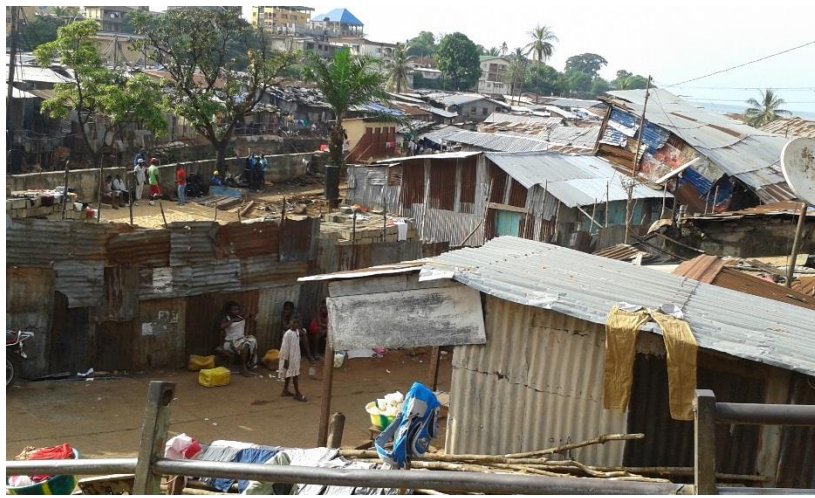
Freetown slum area