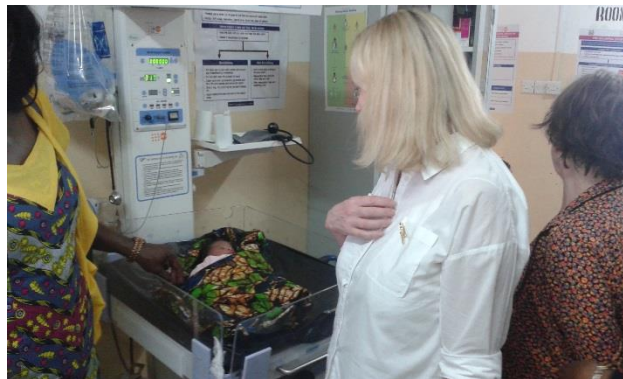
Liz McInnes MP noting a new-born baby on the Maternity Unit, PCMH, Freetown

The hospital appeared extremely busy and underequipped. Women were labouring in single cubicles without bed covers and were quickly taken out of the labour rooms following delivery to allow room for the next queuing and labouring woman. Staff appeared overwhelmed by the amount of work. The laboratory had little equipment and the blood-bank had little blood available.