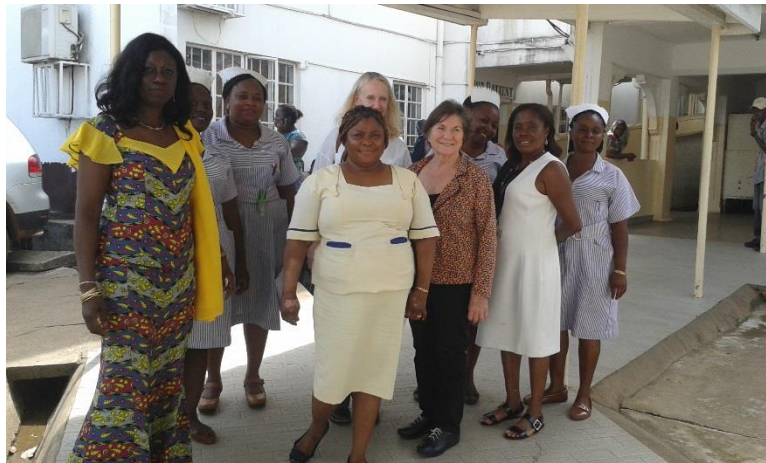
Group 1 UK delegation at the Princess Christian Maternity Hospital