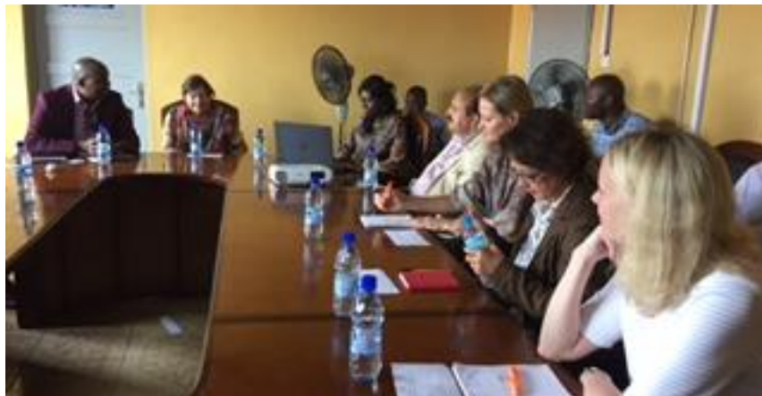
The UK delegation at the Sierra Leone Statistics Unit