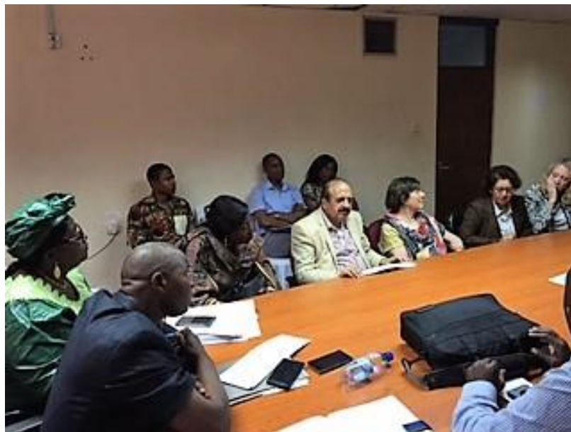
UK Delegates meeting in Parliament with Sierra Leone MPs