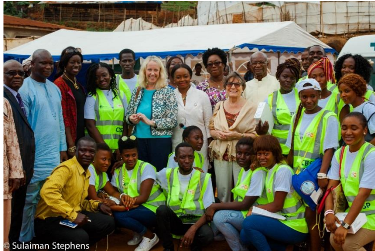
Liz McInnes MP and Baroness Jenny Tonge with a local MP, PPASL staff and community advocates and volunteers