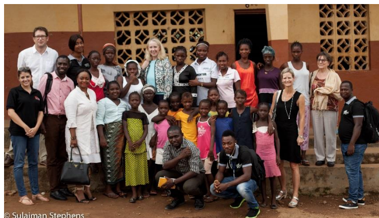
Liz McInnes MP and Baroness Jenny Tonge with UNFPA and Restless Development representatives, Rokel