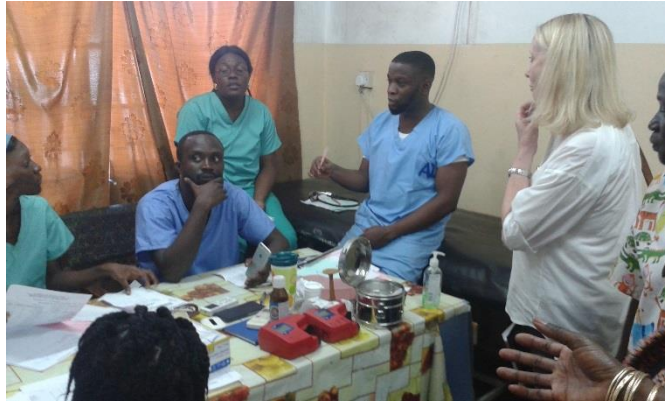
Group 1 UK delegation speaking to staff at the PCMH, Freetown