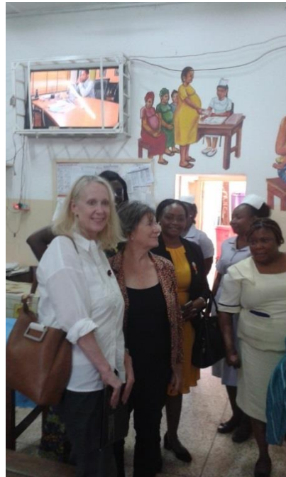
Group 1 UK delegation at the nurse anaesthetic school, PCMH, Freetown