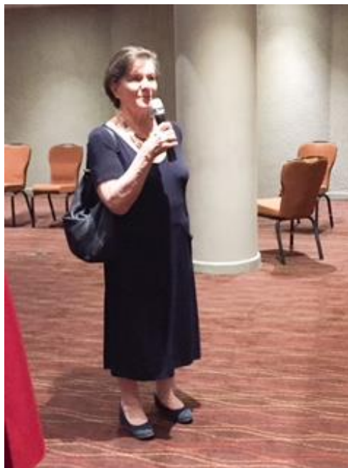
Baroness Jenny Tonge speaking at the reception