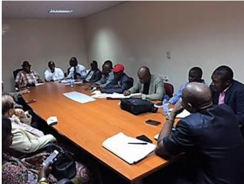
UK Delegates meeting in Parliament with Sierra Leone MPs