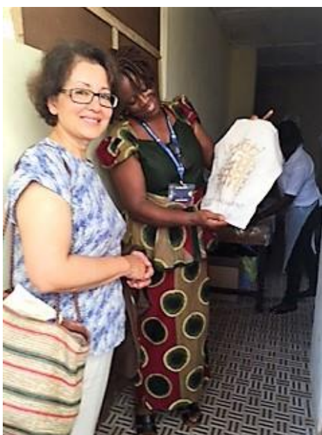
Baroness Sheehan with MSSL staff