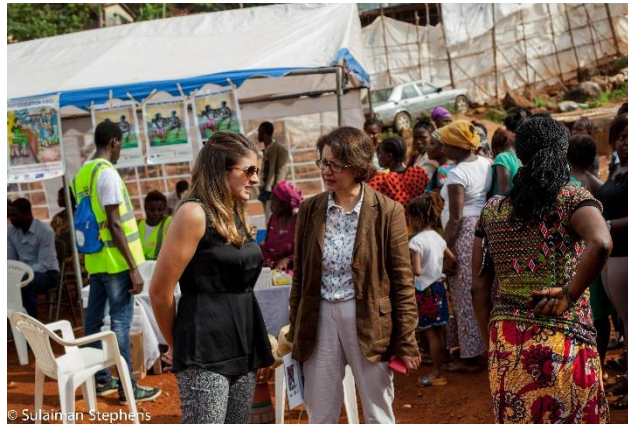
Group 2 UK delegation at PPASL outreach camp, Dwarzak