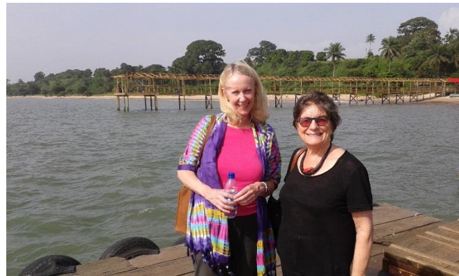
Baroness Jenny Tonge and Liz McInnes MP arriving at sea across from Freetown