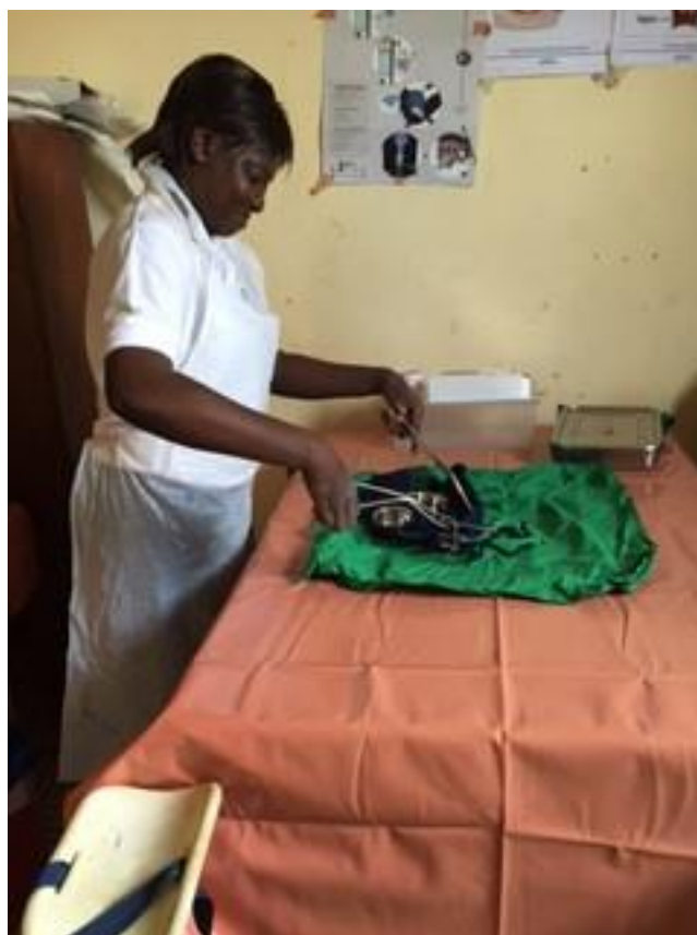
Group 2 UK delegation observing aseptic/non touch technique used by the nurse