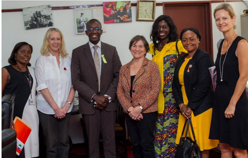
UK delegation with the Minister of Health and Sanitation, Freetown