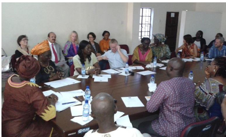
The UK delegation attending Ministry of Social Welfare, Gender and Children's Affairs meeting, Freetown

The Ministry of Social Welfare, Gender and Children's Affairs (SWGCA) held a committee meeting which delegates were invited to attend. The meeting was chaired by the Minister for SWGCA to discuss the creation of five new sub-committees on Media, Legal, Health, Security and Psychosocial care. She requested input from GBV actors present.