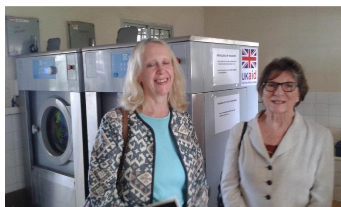
Liz McInnes MP and Baroness Jenny Tonge in front of UKAID donated washing machines, Aberdeen Women's Centre, Freetown