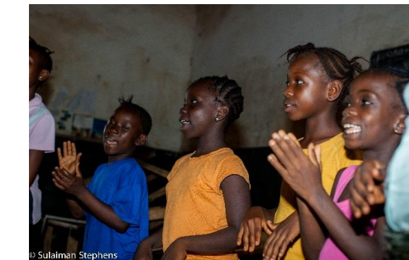
Group 1 UK delegation observing Rokel girls workshop

Delegates observed a youth workshop on the topic of being 'courageous'. The teaching centred on the true story of Malala and the girls present, took it in turns to explain and show 'courage'. After the workshop parliamentarians took the opportunity to speak with the girls individually and the project leaders.