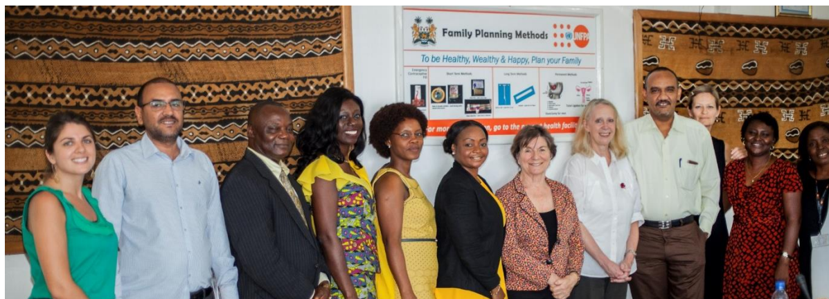
Group 1 UK delegation at UNFPA head office with UNFPA staff, Freetown