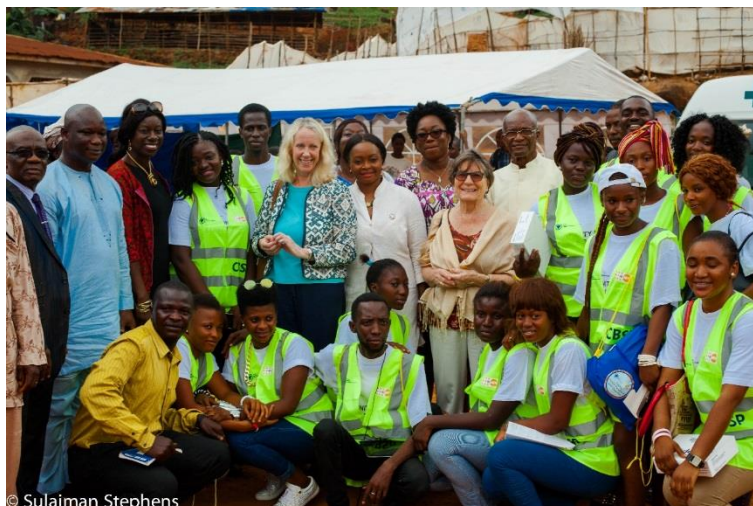
Liz McInnes MP and Baroness Tonge with volunteers and community leaders, Dwasak

Study tour delegates were exposed to an array of family planning and maternal health care services within the Sierra Leone health care system, including ante-natal, intra-partum and post-partum care, emergency obstetric care, support services for unsafe abortions, obstetric fistula, cervical cancers, gender-based violence including FGM, child marriage and domestic violence. This wide exposure allowed delegates to understand the challenges existing within the health system and broader international development issues.