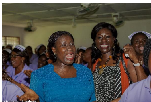
Group 1 UK delegation at Makeni School of Midwifery

The Makeni School of Midwifery was established in 2010 to meet increasing demands for practicing midwives to provide high quality maternity care. The school trains community health nurses as midwives, focusing mainly on rural maternity care. Its revised curriculum is