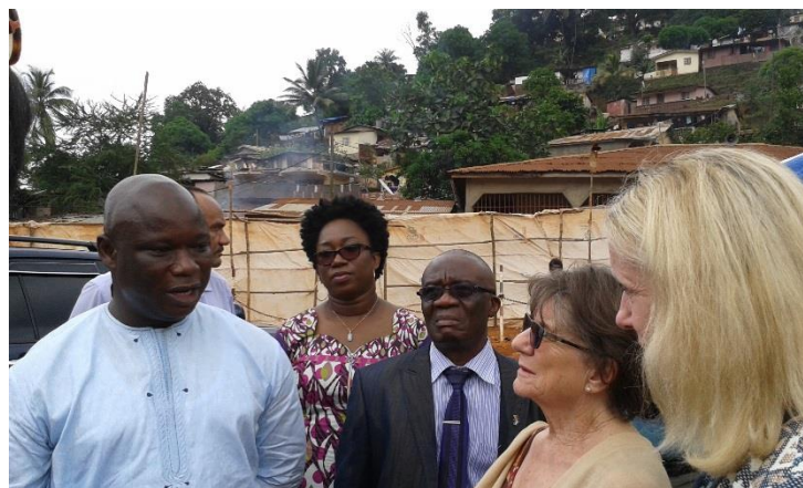
Liz McInnes MP and Baroness Jenny Tonge speaking with a local MP at PPASL outreach Dwasak