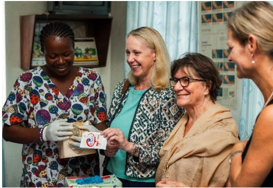
Liz McInnes MP and Baroness Jenny Tonge with PPASL nurse explaining use of female condom

The group 1 UK delegation was accompanied around the various PPASL clinic areas including consultation rooms, the labour room and the minor procedural room. Delegates were exposed to the various contraceptive methods available in the clinic and discussed the morning after pill, menstrual regulation, the availability of safe abortion services, and syndromic management of STIs. A variety of contraceptive methods were available including the female condom, as were oxytocin to prevent post-partum haemorrhage, the most common cause of maternal mortality in Sierra Leone. Vitamin K was also available for newborn babies in order to prevent internal haemorrhage, however no emergency contraception was available. The problem of commodity stock out was also discussed during the visit, as was drug quality control problems in country.