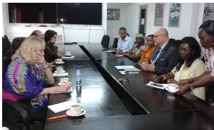
UK delegation with UN Resident Coordinator and Security Chief, UN office

Delegates also had a round table meeting with Priti Patel, the new Secretary of State for International Development at the British High Commissioner's residence.