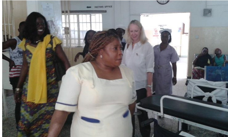
Group 1 UK delegation in outpatient department, PCMH, Freetown