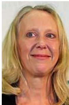
Liz McInnes MP (Labour)

Prior to the study tour Baroness Jenny Tonge said: “I am excited to visit Sierra Leone again and particularly interested in seeing how health care is progressing in Sierra Leone since the Ebola epidemic.”