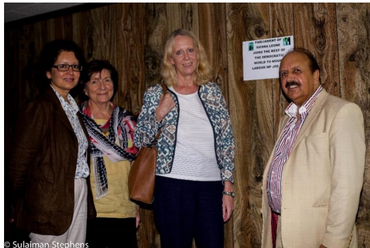
UK delegation in Sierra Leone Parliament in front of a poster with Jo Cox MP and a remembrance message

Delegates also visited the Sierra Leone Parliament in Freetown where they met members of the Sierra Leone Parliament.