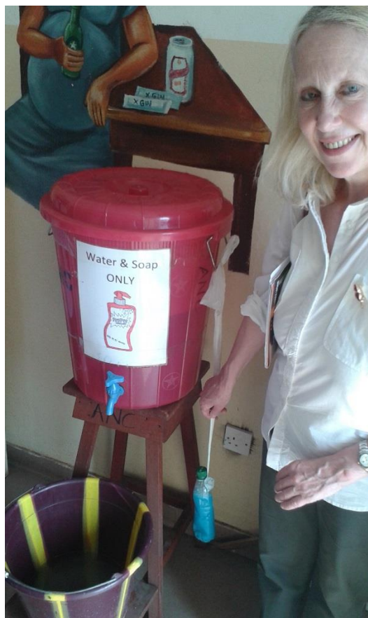
Liz McInnes MP at the handwashing facilities at the school