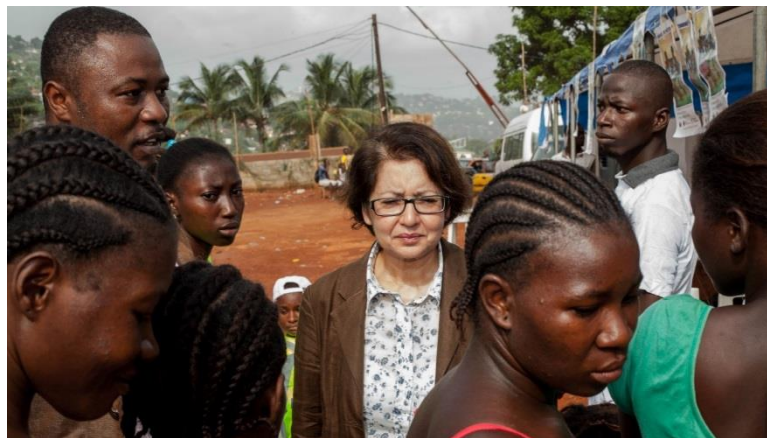
Baroness Sheehan at PPASL outreach camp, Dwarzak

The group 2 UK delegation arrived the night prior and visited the PPASL clinic the next morning. They were accompanied around the various consultation rooms, the labour room and the minor procedural room. The delegation spoke to staff, and was shown the various contraceptive methods available in the clinic.