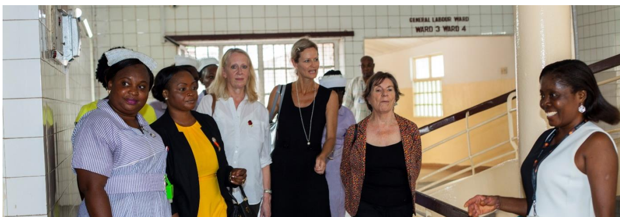
Group 1 UK delegation in PCMH, Freetown

The delegation was accompanied around the hospital premises and wards, including the labour ward, the ante-natal and post-natal wards, as well as the laboratory. Delegates spoke to staff and clients in the various departments.