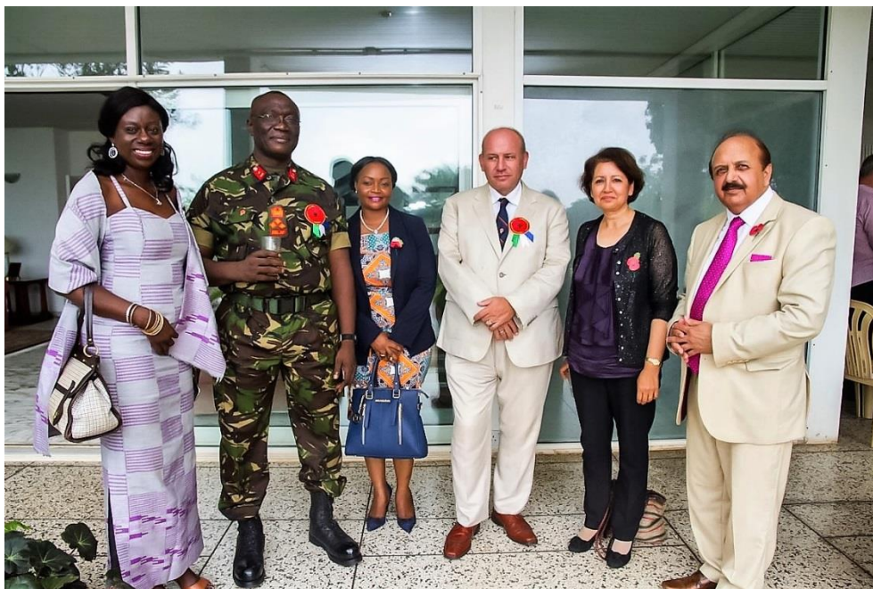
Group 2 UK delegation at British High Commission reception.

The group 2 UK delegation were invited to and attended a reception at the British High Commission for Remembrance Day before departing to the airport.