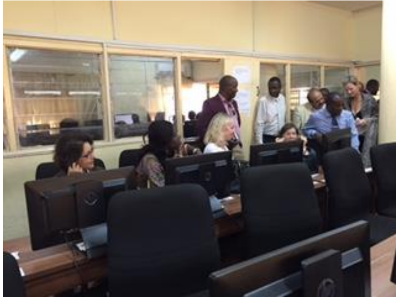
The UK delegation in the statistics unit in front of data entry computers

The Statistics Sierra Leone (SSL) conducts Population and Housing Census and collects, compiles, analyses and disseminates accurate, reliable and timely statistical information for informed decision-making by the government and the general public. The vision of Sierra Leone Statistics Unit is to create a sustainable National Statistical System for the coordination and production of official statistics that will assist evidence-based decision-making.