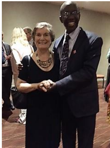
Baroness Jenny Tonge and Dr Abu Bakarr Fofanah, Minister of Health and Sanitation