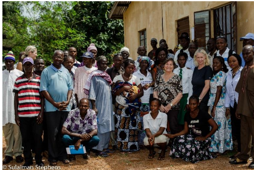
Binkolo Husbands' School, Northern Region