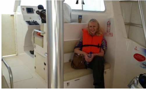
Baroness Jenny Tonge and Liz McInnes MP crossing the river to Freetown airport