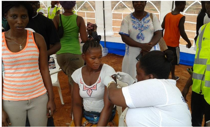
PPASL client receiving depo injection at popup camp