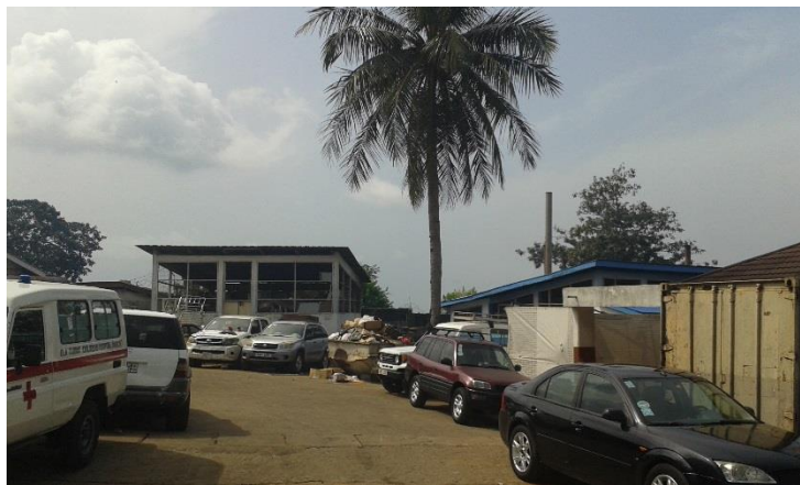
Incinerator and mortuary noted in the corner of the PCMH, Freetown with vultures above in the tree branches.

Walking across the hospital ground from the main building to the nurses anaesthetics school, vultures were noted circulating and in the trees around the mortuary.