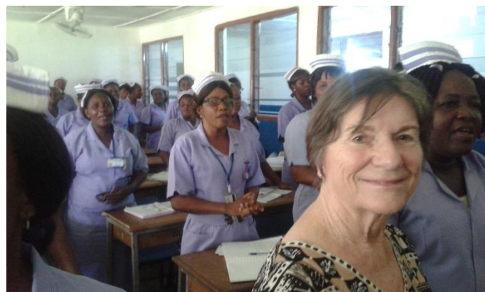
Baroness Jenny Tonge and Liz McInnes MP observing midwifery training, Makeni