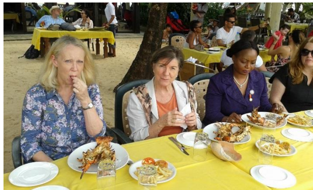
Group 1 UK delegation enjoyed the local fishermen's catch of the day 'lobster' – (numerous fishermen lived in this area and made their livelihood from lobsters), Freetown

After lunch the group 1 UK delegation was driven around Freetown, to familiarise themselves with its population, housing and general living conditions.