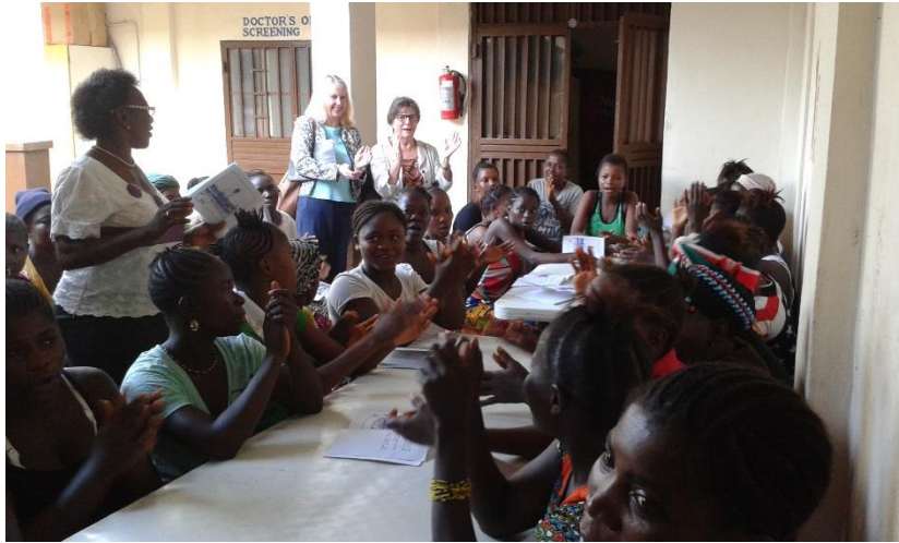
Liz McInnes MP and Baroness Jenny Tonge joining in singing, Aberdeen Women's Centre, Freetown

Group 1 UK delegates met a group of girls awaiting fistula repair. Counselling, education and life skills and support were provided whilst the girls were waiting for the life changing surgical repair.