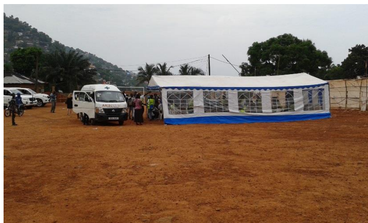
PPASL outreach clinic, Dwasak

The group 1 UK delegation proceeded to visit a PPASL outreach camp and met with leaders of the community including a local MP and youth volunteers. All were delighted to welcome the PPASL outreach camps, which would appear in various locations throughout the year. The outreach camps ensured services were available and provided to all those in need close to their homes. The clinics were always busy with many young clients requesting depo as their preferred contraceptive method.