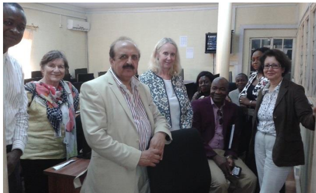
UK delegation in statistics unit

A discussion followed with regards to how the interviews had been conducted. The actual interviews had been face-to-face interviews lasting 30 – 60 minutes each, and 16 000 staff had been involved. The census will be very useful for the 2018 DHS and all other surveys, due to the capacity building processes built into the census.