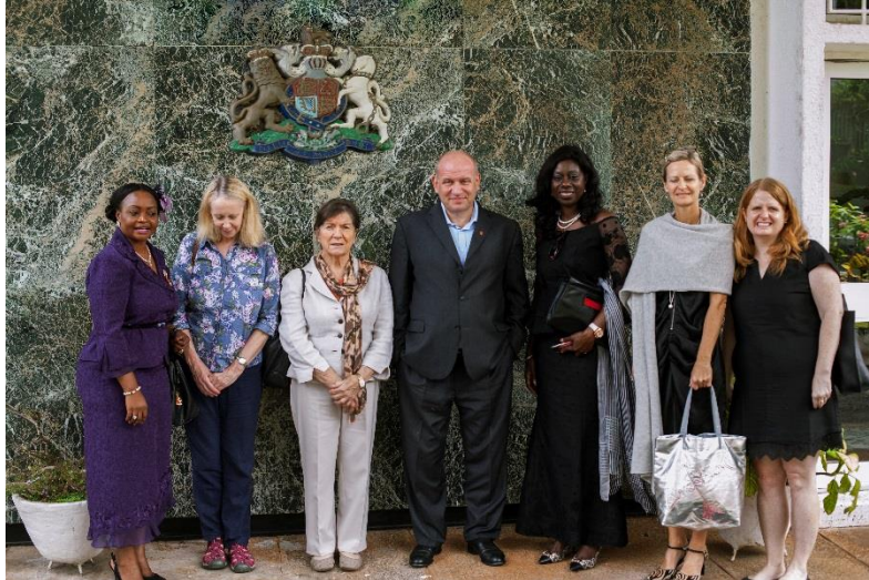
UK delegation at UK High Commission with UNFPA staff, Freetown

British High Commission Residence, 11:00 – 12:00