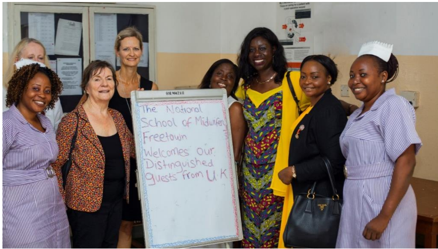
Group 1 UK delegation with UNFPA representatives and midwifery teachers, National School of Midwifery, PCMH, Freetown

The National School of Midwifery, under the directive of the MoHS was situated in another corner of the PCMH. It is a centre of excellence for midwifery education in Sierra Leone. The mission of the school is to produce competent midwives who are skilled professionals, offering quality reproductive services to women, children, and communities in settings with various levels of care.