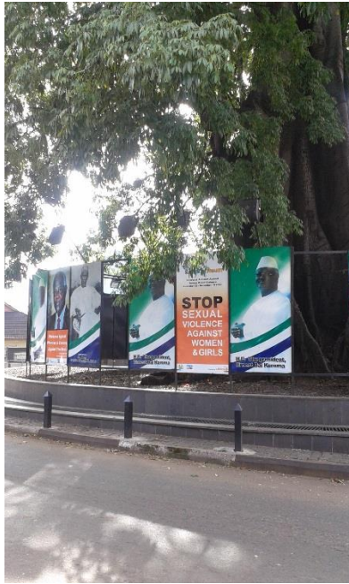
Freetown Cotton Tree with Gender Based Violence posters

The delegation passed Freetown's historic symbol, the Cotton Tree, which is the city's most famous landmark. Nobody is sure how old the tree is, but it is known to have existed in 1787 when the first settlers arrived. According to some sources, the Cotton Tree is 500 years old. Interestingly, the tree was surrounded by posters reading: 'STOP sexual violence against women and girls'.