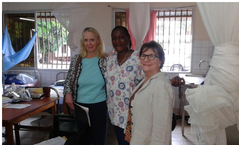
Liz McInnes MP and Baroness Jenny Tonge speaking to senior fistula repair nurse/manager, Aberdeen Women's Centre, Freetown

The group 1 UK delegation met with the latest 60 clients awaiting fistula repair. Foreign doctors volunteering would arrive and carry out the repair, as no in-country doctors were currently able to perform this often complicated surgery. Junior doctors would be taught during procedures. It would be commonplace for 5-6 girls to be repaired per day.