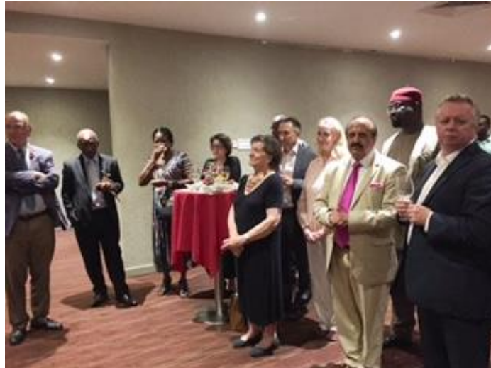
Evening stakeholder reception