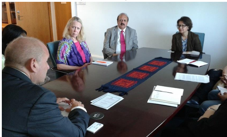
UK delegation at British Embassy

British High Commission Head Office, Freetown, 09:00 – 10:00