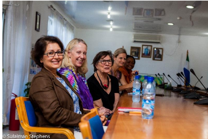
UK delegation at UNFPA conference room, Freetown