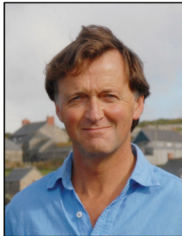
Andrew George MP Chair, APPG on Global Tuberculosis

Tuberculosis (TB) is a global disease which despite being preventable, treatable and curable, every year kills 1.7 million people. Rates of TB are falling at a frustratingly slow pace and due to population growth there are now more than 9 million new cases of TB each year.