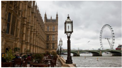
A Japan lunch in Parliament; the Terrace; and traditional Japanese dancers at the APPG's summer reception 2014